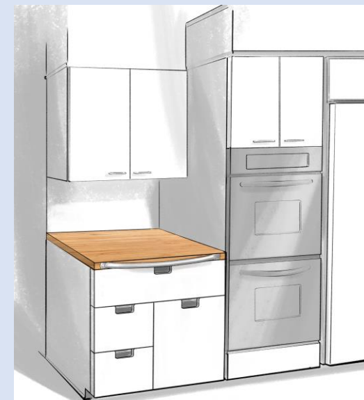
Option 2: Unit B