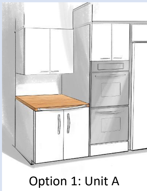
Option 1: Unit A