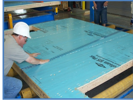
Figure 6 – Factory Installed Seam Tape

The continuous drywall method allows for continuous insulation and drywall air barrier where a partition wall meets the exterior wall. This method requires panel layouts to hold the interior wall 1” from the exterior wall to allow the drywall on the exterior wall to be slid into place behind the interior wall intersection. A standard structural metal strap was used to connect the top plates of the interior and exterior walls. To complete the wall air sealing methodology, closed cell polyurethane foam was sprayed from the attic side over all top plates (and other ceiling penetrations) in order to air seal this critical area.