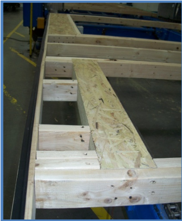
Figure 2 – Optimized Framing: Engineered Headers

The wall panels were built in a factory (panelized) in 12’ and 16’ lengths and shipped to the site. The 16” o.c. stud spacing was used for 2” x 4” nominal dimension wall framing to allow for multiple stories in similar 2-story house designs and to provide sufficient attachment area for the insulating sheathing and siding. As part of the factory fabrication process, synthetic (EPDM) rubber gaskets were installed along the face of the top and bottom plates prior to the placing of the SIS panels.