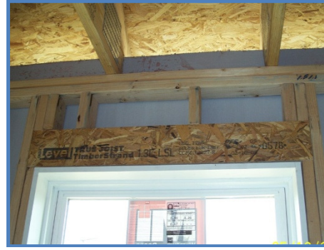
Figure 11 – Interior Window Installation