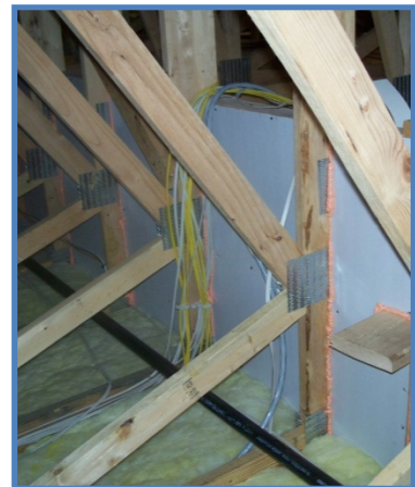
Figure 9 – Attic Knee Wall with Sealed Air Barrier

Windows and doors that use wood trim required jamb extensions to accommodate the thicker exterior sheathing dimension. Windows were installed and flashed per OEM specifications and then air sealed around the rough opening from the interior using low expansion foam. All other wall penetrations were flashed and air sealed. Rigid air barriers at the fireplace, bathroom tub, and framed cavities and bulkheads were installed, sealed, and insulated in the field as required. Garage-side drywall was sealed at top and bottom plates and around the door and electrical boxes. The fiberglass batt wall cavity insulation was installed per RESNET Grade I guidelines.