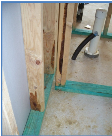
Figure 7 – 1” Interior Wall Offset for Continuous Drywall Method

The continuous drywall method allows for continuous insulation and drywall air barrier where a partition wall meets the exterior wall. This method requires panel layouts to hold the interior wall 1” from the exterior wall to allow the drywall on the exterior wall to be slid into place behind the interior wall intersection. A standard structural metal strap was used to connect the top plates of the interior and exterior walls. To complete the wall air sealing methodology, closed cell polyurethane foam was sprayed from the attic side over all top plates (and other ceiling penetrations) in order to air seal this critical area.