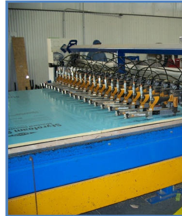
Figure 4 – Factory Installed SIS Panel Sheathing

The SIS panels were sized to full height (vertically) to eliminate horizontal seams, and then vertical seams were taped where possible in the factory prior to shipment. This fabrication process was developed to provide as much of the air sealing details in the factory to minimize the field work necessary to ensure a consistently tight building envelope. On site, the wall panels were installed over a sill gasket and the floor-panel seam caulked. All sheathing seams not taped in the factory were subsequently taped in the field, and panel-to-panel connections were air-sealed.