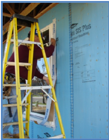
Figure 12 – Window Installation including Flashing and Air Sealing