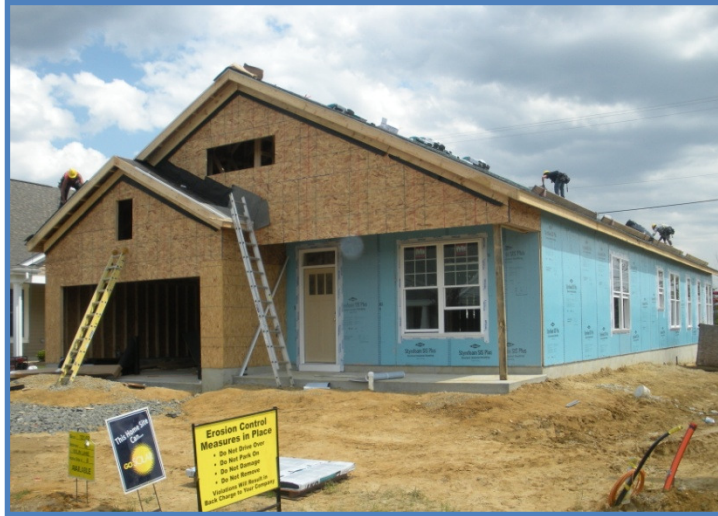
Figure 15 – K. Hovnanian’s Monmouth High Performance Test Home

specifications) was developed and these changes were listed in their proper construction sequence to avoid costly delays. These “monitoring points”, additionally identified as either requiring a trade review (training), documentation (inspection), or testing, were then incorporated into the actual construction schedule in order to manage the changes. The development of the monitoring points (15 total: 5 reviews, 3 tests, & 7 documentation points) and integrating them into the construction schedule ensured that