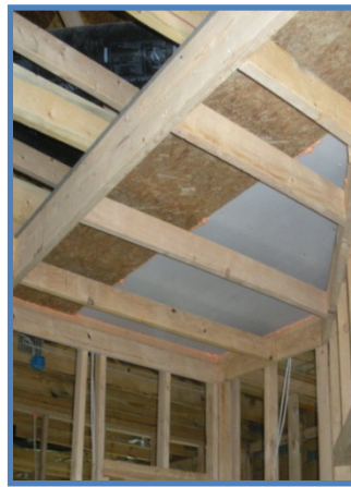
Figure 13 – Rigid Air Barrier Sealed