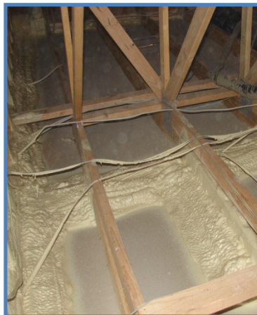
Figure 8 – Attic Top Plates Sealed with Spray Foam