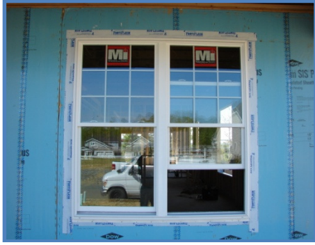
Figure 10 – Taped SIS & Exterior Window Installation