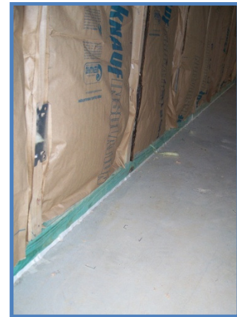
Figure 14 – Fiberglass Batt Wall Cavity Insulation