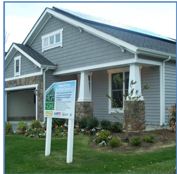
Figure 1 – K. Hovnanian’s Monmouth High Performance Test Home

The high performance wall design was implemented into K. Hovnanian’s Monmouth High Performance test home. This Building America test house, built in 2009, is a single story, slab-on-grade design located in the mixed humid climate (climate zone four). While a primary goal of the project was to meet or exceed the Building America (BA) 40% Whole House Energy Savings target over the 2008 BA Benchmark, a secondary goal was to develop a wall system that would conform to future energy code requirements for the mixed humid and/or cold climates. The implementation of new products and practices to improve energy efficiency has the potential to create unintended moisture and durability issues and have increased cost implications. For this project, a number of wall frame/insulation/air sealing combinations were considered and modeled in order to meet the project goals. The features considered included site built versus panelizing, 2x4 versus 2x6 framing, OSB sheathing with and without exterior rigid foam, structural insulated sheathing (SIS), air sealing products and methods, and various wall cavity insulation types and densities of fiberglass batts, blown loose fill fiberglass, cellulose, and spray foam.