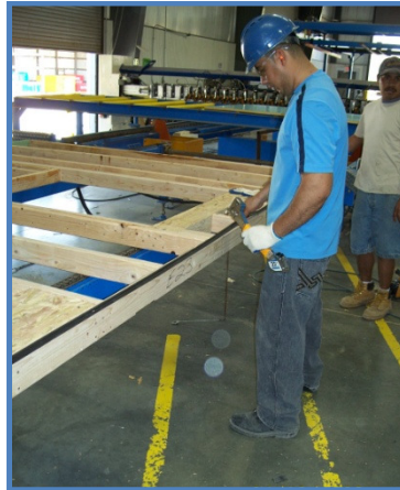
Figure 3 – Factory Installed Gaskets