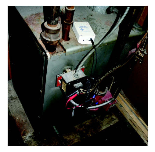
Figure 3 Discrete datalogger to monitor boiler runtime.

primary and storm windows. Although outdoor data was recorded at two homes, weather data from nearby Chicago Midway Airport was used as the official outdoor conditions.