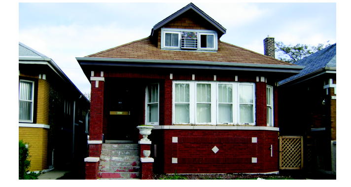
Figure 1 Subject house #4—typical 1920s and 1930s Chicago bungalow.

climate and provide guidance to home energy efficiency raters wishing to analyze storm window performance with energy simulation software.