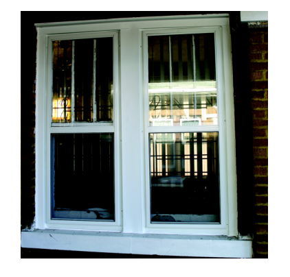
Figure 2 Single-pane, double-hung sashes with new low-e storm window.

To obtain baseline measurements, the existing storm windows were removed from all the homes (except for one window on one home). The houses were occupied during the measurement period. All occupants were instructed not to change their thermostat settings or heating patterns during the test. This enabled comparison energy used by the house before and after the storm window retrofit. Four homes were then fitted with low-e storm windows and the remaing two homes had clear storm windows installed.