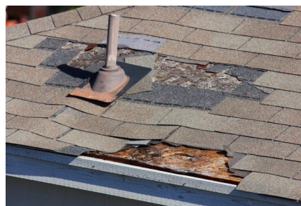
Figure 2. Damaged Shingles and Rotted Roof Deck.

Water intrusion at roof penetrations can be prevented by proper flashing. Flashing is required at plumbing vents, masonry and metal chimneys, exhaust vent caps, dormers, and skylights. Flashing must be integrated with the roof covering (e.g., shingles) and roof underlayment and installed shingle-fashion such that the top layer of the roofing or flashing laps over the bottom layer to prevent water from draining behind the bottom layer. Roofs should be inspected periodically, and flashing repaired or replaced as needed.