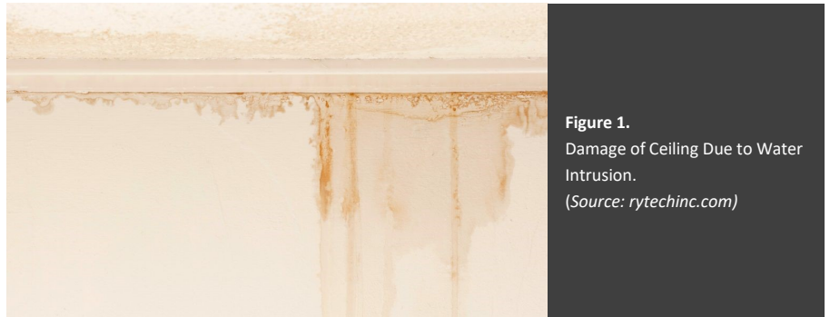
Figure 1. Damage of Ceiling Due to Water Intrusion.

Deteriorated or incorrectly installed flashing at roof penetrations such as plumbing vents, chimneys, and skylights can allow rainwater to enter through the roofing that can damage the roof structure and interior finishes. Visible water stains are usually the first indication water has leaked through the roof. Water will travel through the path of least resistance and may leave a stain far from where it first penetrated. Homeowners can inspect for water intrusion at roof penetrations by carefully looking for signs of leakage in the attic, water stains on the roof sheathing or even walls below, wet insulation, and deterioration of roof coverings and roof deck. The flow of water on the roof should be observed from inside if possible and outside while it's raining and afterwards.