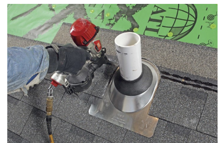
Figure 3. Integrating Roof Penetration Flashing with Shingle.