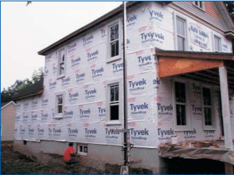
Air barrier on outside of house

that an additional 60% of heating and cooling energy would have been required to operate the home 10 .