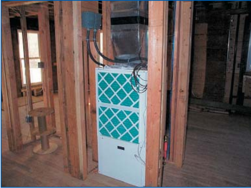
Ground source heat pump in conditioned space

on the property, and the builder desired not to use heating oil.