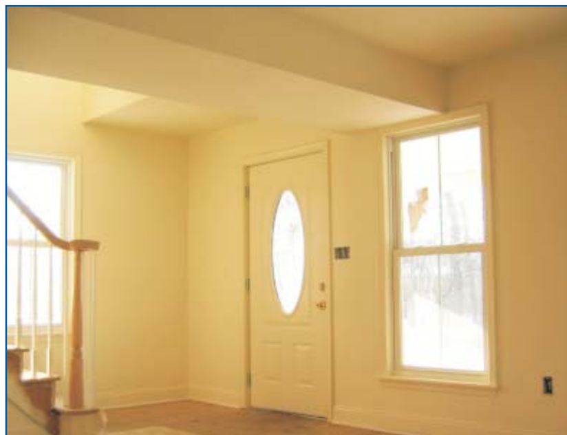
Energy efficiency windows and door in cottage

The additional cost of selecting energy efficiency features for the windows varies significantly between manufacturers. Generally, the added cost of low-E coatings and gas fill ranges from a low of a few dollars per window to nearly $100. But many manufacturers offer an energy efficient option that includes low-E coatings or a combination of low-E coatings and gas fill, for their windows at a cost of about $2/sf of window area. For the case study house with 196 sf of windows then, the additional cost for energy efficient windows is about $400.