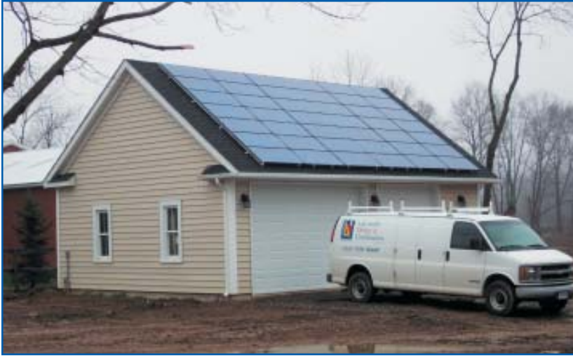
Garage PV system for cottage home

The power conditioning inverters are located inside both in the garage and basement of the home. The out of pocket expenses for the homeowner are approximately $15,120. The NJCEP rebate paid for 70% of the system or $35,280. The system is expected to produce approximately 9,000 kWh per year.