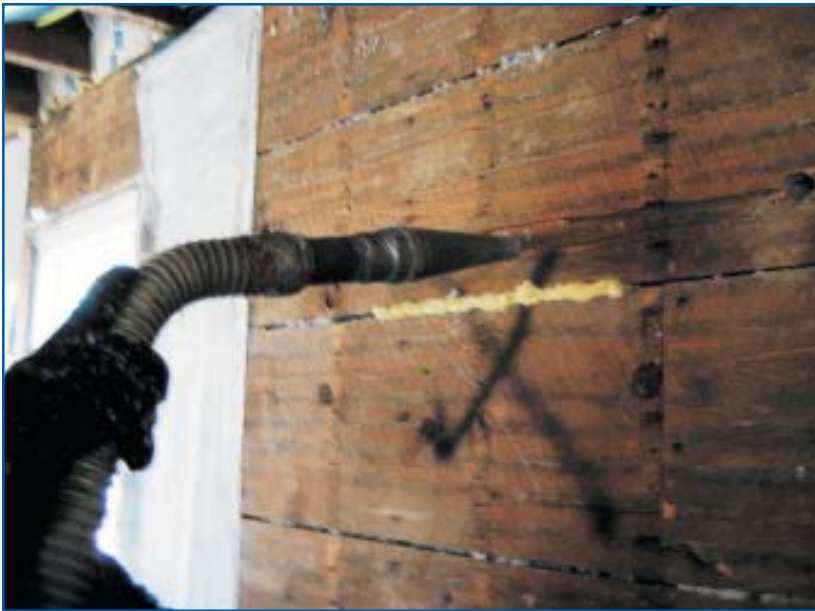
Insulation blown into wall cavities

with 1338 sf of retrofitted insulated wall area is $2,900.