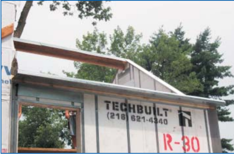
Ridge and eave supports for roof panels