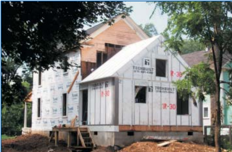
Addition constructed in 6 hours

addition with a vented attic. The choice to use structural panels allowed for the creation of a cathedral ceiling in the room and dramatically decreased the close-in time for the project. Once the conventional wooden deck had been built, it took the remodeler's crew of three, plus two support technicians from the panel manufacturer