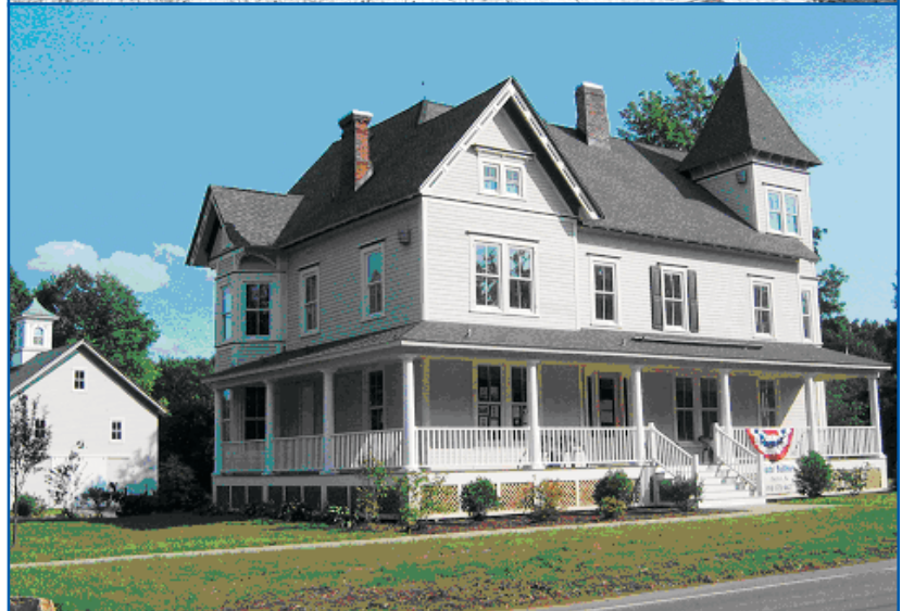
The main house on the same property