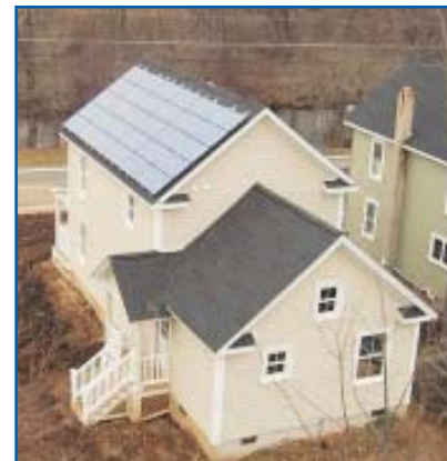
Aerial view of PV system