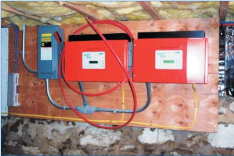
PV system inverters

The power conditioning inverters are located inside both in the garage and basement of the home. The out of pocket expenses for the homeowner are approximately $15,120. The NJCEP rebate paid for 70% of the system or $35,280. The system is expected to produce approximately 9,000 kWh per year.