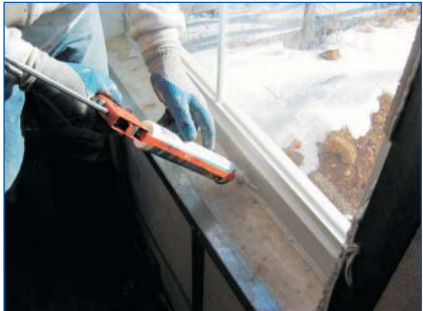
Air sealing around windows

Though the choice of insulation was primarily made for other reasons, dense packed insulation will also aid in controlling infiltration by reducing airflow within wall cavities. If air-sealing strategies had been ignored during the gut-rehab it is estimated