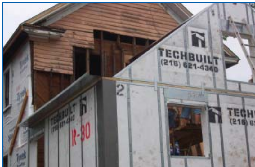
Addition construction using foam panels

The addition is made from pre-manufactured structural EPS foam and steel tube panels and therefore does not require any additional structural supports. The floor of this addition is made of conventional solid wooden joists and plywood decking. The original design called for a conventionally framed