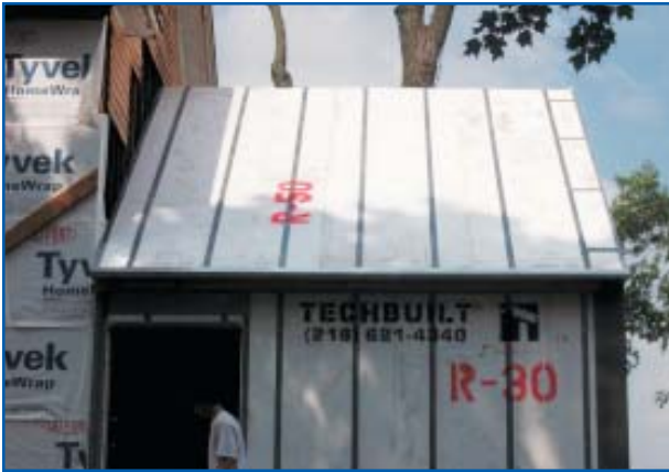
R-50 roof and R-30 wall panels