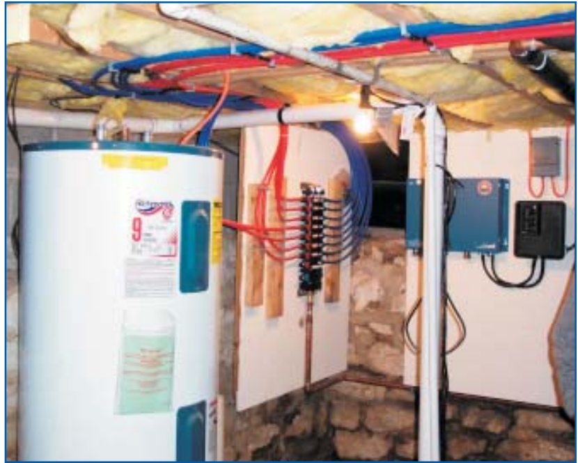
Hot water system in cottage

The original design for the water heating system was to include a “typical” propane-fired storage tank with an energy factor of approximately 0.56 located in the basement. While this would have been a relatively inexpensive option to purchase and install, the performance of this equipment, and expected standby losses due to its location in unconditioned space, would have cost significantly more to operate over its lifetime. The choice of