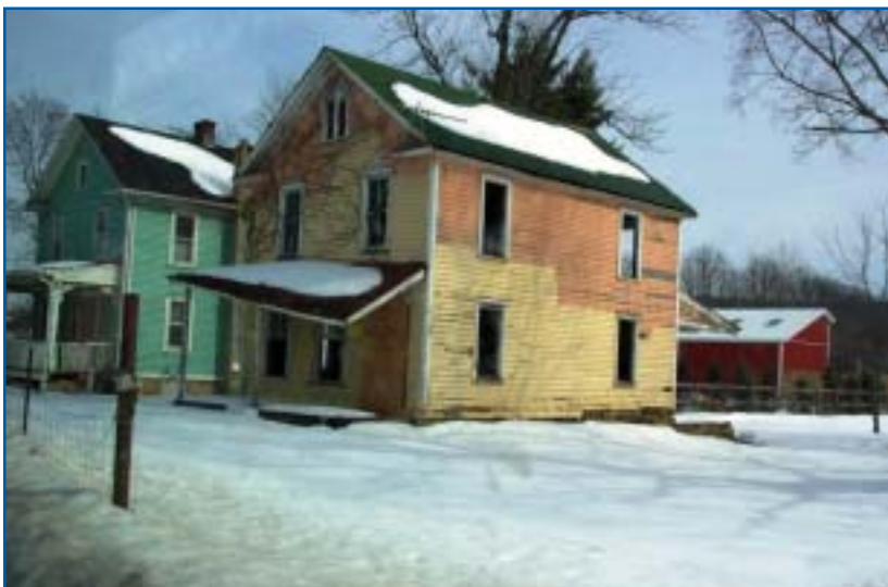
The site of the "gut rehab"

test the application of energy efficiency (EE) strategies, to evaluate the benefits, and to identify any weaknesses in their design or application. Taken together as a system, the strategies provide opportunities for energy and cost savings, increased durability, and increased comfort of the remodeled home.