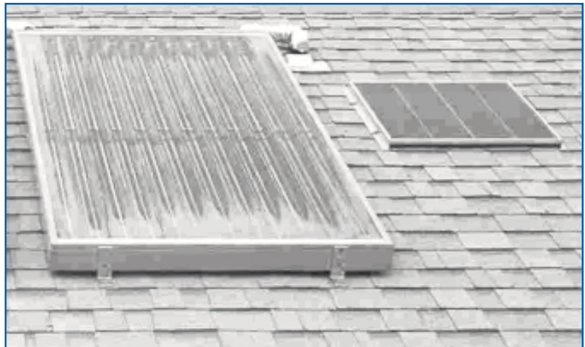
Solar thermal collector with PV panel for pump

a solar preheated tank and tankless demand heater limited the storage tank losses to energy generated only by the solar system. The solar contribution is expected to represent approximately 57% of the annual hot water load. The estimate for the cost of