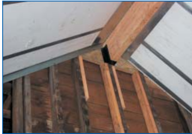
Ridge beam for roof support

generators for example, that can provide an alternative to utility energy supply, the engine systems still require regular purchase of fuel such as diesel or gasoline – that can change in price, sometimes dramatically and quickly.