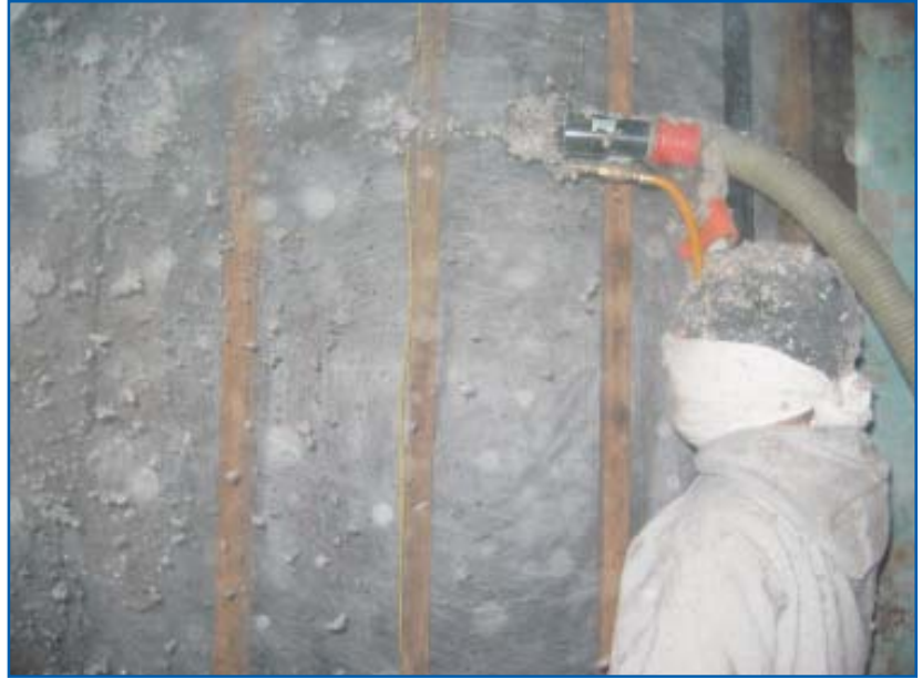
Blown cellulose insulation

The estimated installation costs 7 for blown cellulose insulation is approximately $0.43/sf with an additional $1.74/sf to drill holes for blowing access. The total installed costs then for installed blown cellulose insulation is about $2.17/sf of insulated wall area. Further, the estimated installed cost of the wall insulation of the case study house