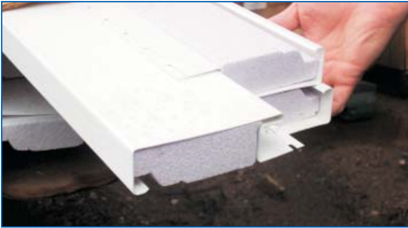
Insulated siding trim

Based on the cost estimates and primarily the labor savings with a larger coverage area, there is virtually no difference between the installed costs of each system. The cost of installing the board insulation to provide a thermal break for the framing adds approximately $970 but with the selection of the insulated vinyl siding, the additional cost is about $900.