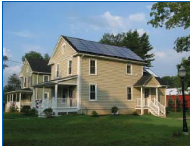
PV system on cottage home

A 3.0 kW mono-crystalline system is located directly on the Cottage roof with a 4.2 kW system located on the garage roof also feeding into the building’s utility service.