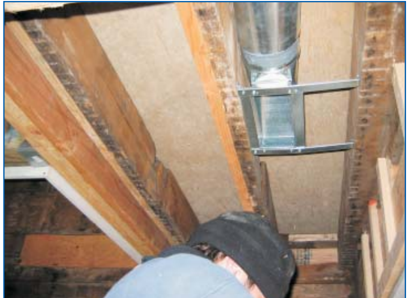
All duct joints sealed

mastic was installed on all duct connections. These improvements to efficiency of the distribution system allowed the unit to be downsized by one-half a ton.