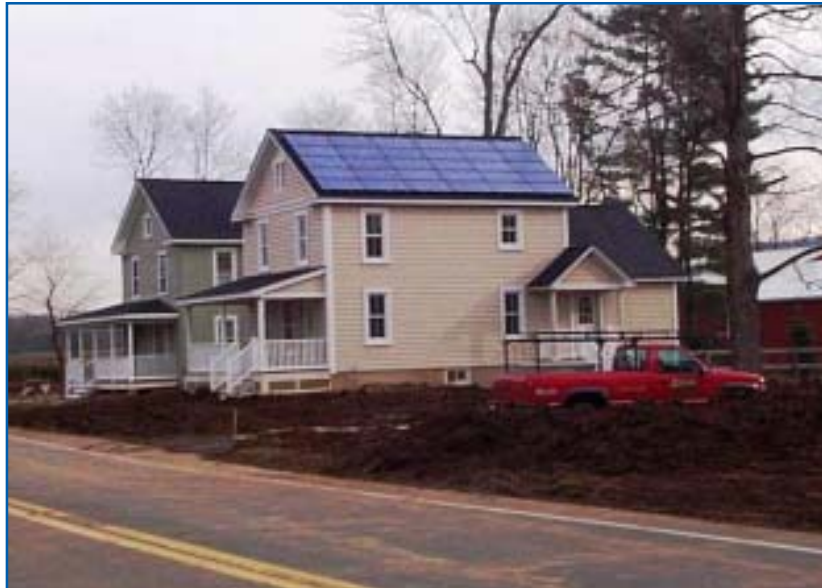
The "gut rehab" one year later

The goal of the Strategies for Energy Efficiency in Remodeling (SEER) 1 project is to provide information, based on research and case studies, to remodelers and consumers about opportunities to increase home energy performance. Opportunities to include energy efficiency often arise while undertaking general remodeling work. Of course, energy efficiency may always be pursued as a remodeling project unto itself to improve the comfort of the home and reduce monthly utility bills. A case study in the mid-Atlantic region was undertaken to develop and