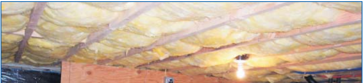
Floor insulation between joists

Many remodeling projects involve basement or crawl spaces that were originally uninsulated, as is true for this case study. Though constructed with a basement, the foundation space was and will continue to be unconditioned. Isolating the unconditioned basement space from the conditioned house was achieved simply by insulating the floor joist space. The most common insulation method for the floor joist space is batt insulation, using unfaced batts. However, this is also an excellent location for spray applied foam insulation products, especially those with a low permeability.