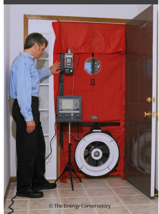
Blower Door Test